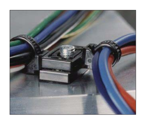
T50SOSWSP5E, parallel installation using two stud mount lateral ties.